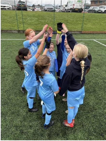
The girls that can! Our U11 girls' football team winning time after time!

Please also see your child's class pages on the school website.