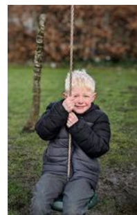
We are loving our forest school on a Tuesday afternoon. Outdoor learning is the best! Even the muddy boots are worth it!