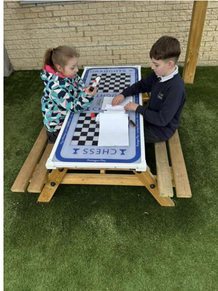
Whether it's a peaceful lunchtime, one filled with energy or a quiet game focused break, there is always plenty of activities to be involved in at Blakehill. There's something for everyone!