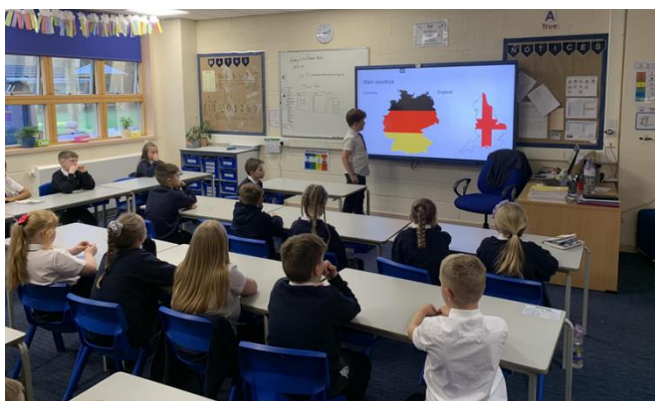
Home learning projects confidently shared with our friends in Year 5