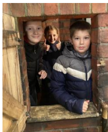
Autumn Term 2024

What an interesting time our Year 5 pupils had at the Yorkshire Coal Mining Museum last week, discovering what the life of a miner was like in years gone by. A 140-metre journey into the mine, travelling deep beneath ground level, gave us a real taste of the dangers of this occupation.