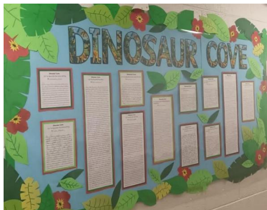
The corridors have a fresh new look and are filled with the children's work. Each year group has produced a display to showcase the work they have been doing in English lessons. Take time to read some of the fantastic pieces of writing during your visit at parents evening.