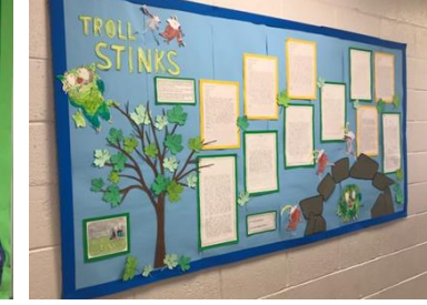
Speak Out has been the theme for our whole school anti-bullying project this term