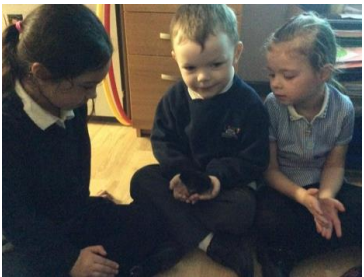
The chicks have arrived in Reception and are helping the children to learn about moving and growing. Making memories!