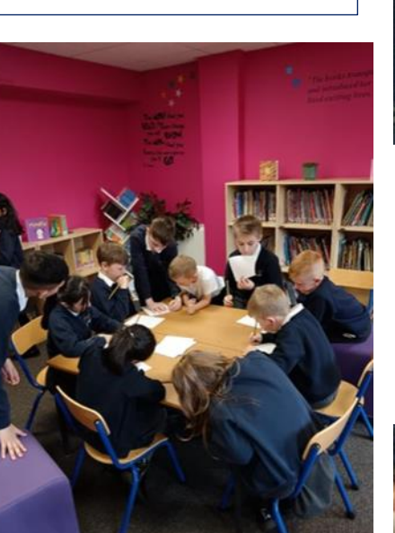
Blakehill School Council discussing ideas for further school improvement.