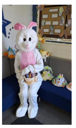
There was a very special guest in school