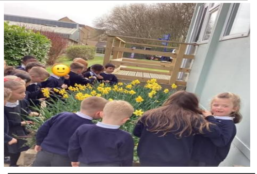
Outdoor art lessons.