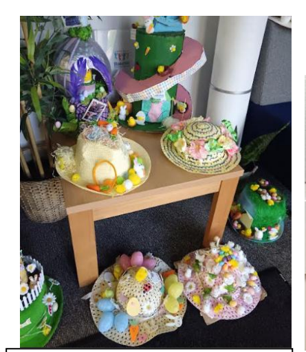
We had a great response to the PTFA Easter bonnet competition

It has been such a busy few weeks in school with lots of exciting activities going on. Education is the adventure that never ends, always leading you to new discoveries.