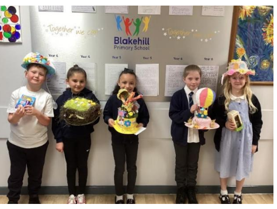
Our KS1 and KS2 competition winners