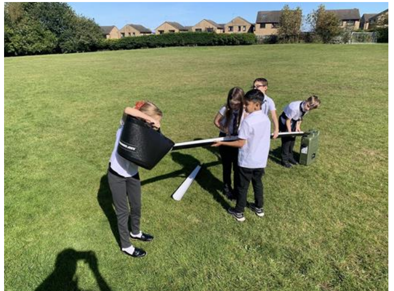
Developing our communication and teamwork skills in year 4