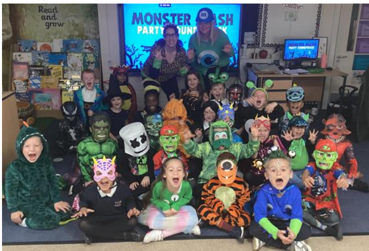
Children and adults had a 'monstrous' day in school on Wednesday during their dress as a monster day.